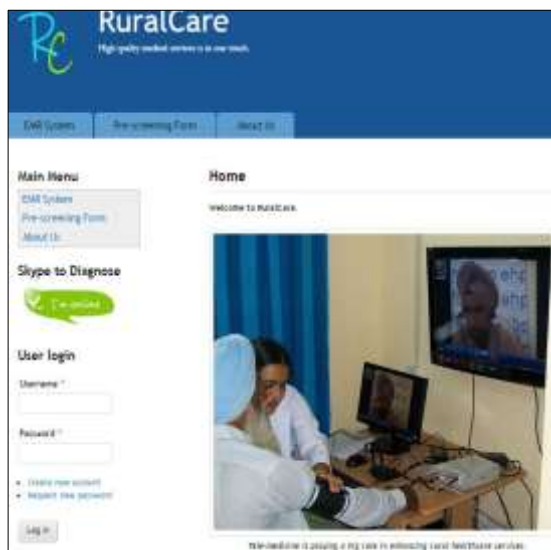
Figure 2: The main page of RuralCare prototype

Based on the proposed framework, RuralCare, a web based application has been developed as shown in Figure 2. RuralCare supports teleconference and is able to store patient medical records with the integration of Skype and OpenEMR into RuralCare. Oracle Database cloud service has been applied on OpenEMR, where the patients' medical data are stored. Figure 3 shows that Skype as the videoconference tool and integration of OpenEMR into RuralCare. Besides that, a dengue fever pre-screening form is also being included in the RuralCare prototype that is shown in Figure 4 and 5. This form applies rule-based reasoning that is able to detect suspected dengue patients based on the symptoms that are shown by the user.