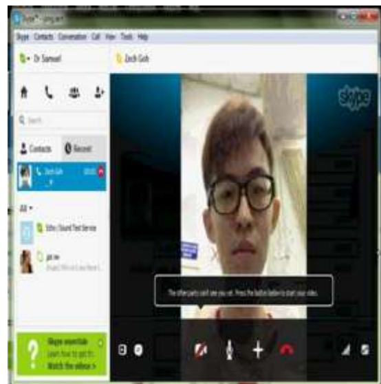
Figure 3: Skype is integrated in RuralCare prototype as the videoconference tool